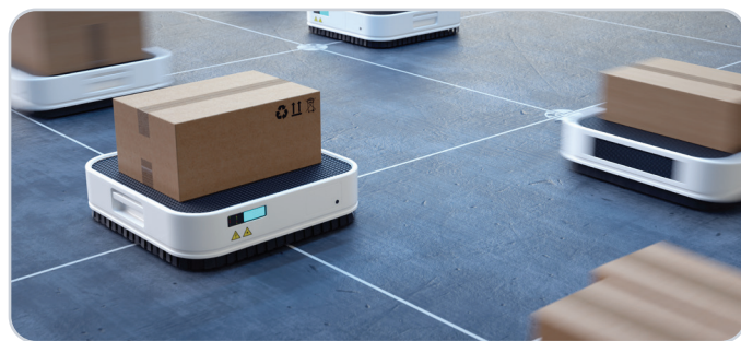
Available in sizes ranging from 2" to 22" OD and supporting loads up to 34,000 lbs.